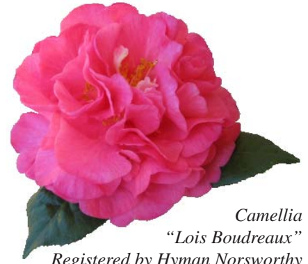
Camellia "Lois Boudreaux" Registered by Hyman Norsworthy featured on the 2007 Garden Tour brochure